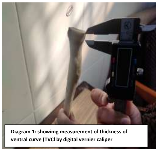
Diagram 1: showing measurement of thickness of ventral curve (TVC) by digital vernier caliper