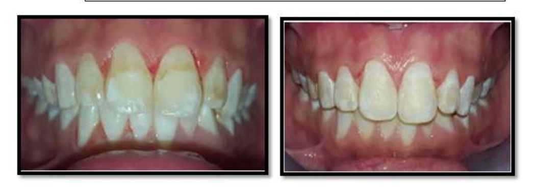
FIG 1: CASE 2.B - Pre-operative and Post-operative images