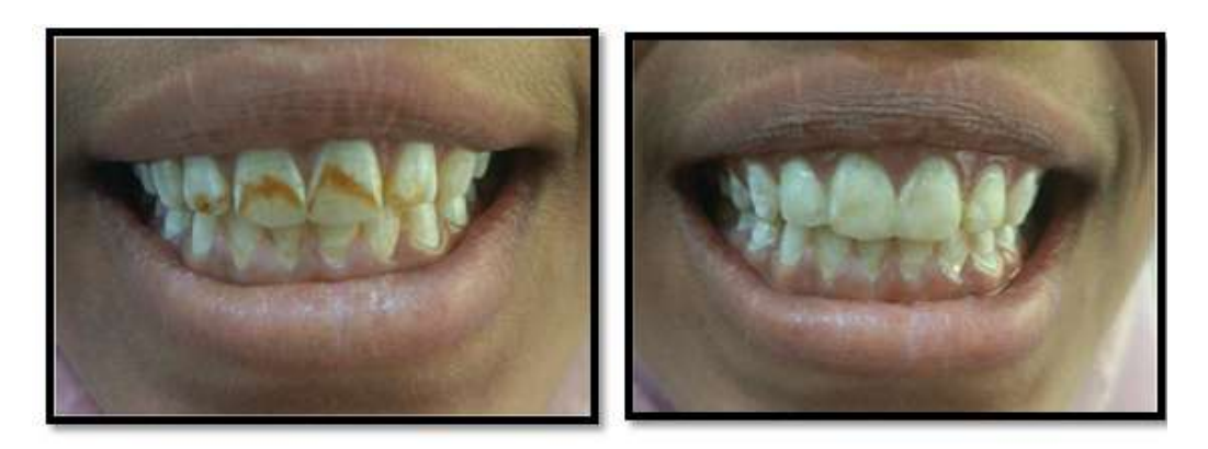
FIG 3: CASE 3.A - Pre-operative and Post-operative images