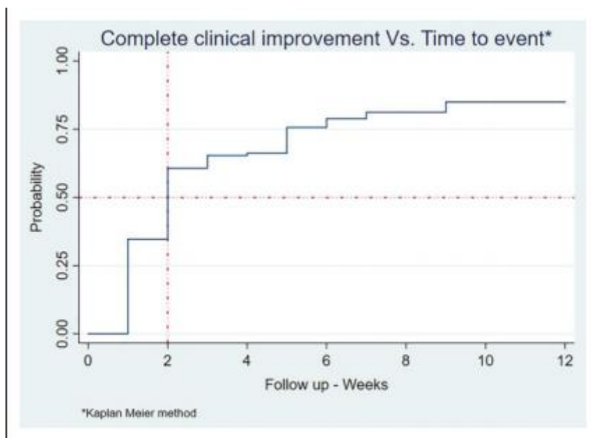
Figure 2. The graph shows the probability of complete improvement related to the follow-up time.