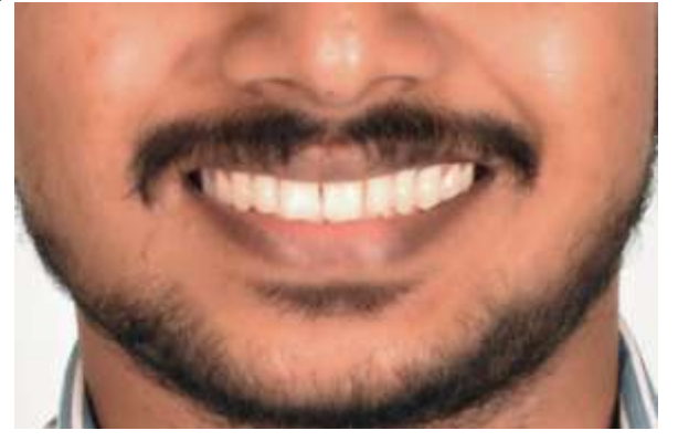
Figure 10: SUBJECT M4 - BUCCAL CORRIDOR AT 6mm