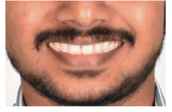
Figure 8: SUBJECT M2 - BUCCAL CORRIDOR AT 2mm