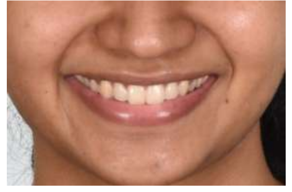
Figure 4: SUBJECT F2 - BUCCAL CORRIDOR AT 2mm