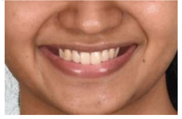
Figure 7: SUBJECT M1 - BUCCAL CORRIDOR AT 0mm