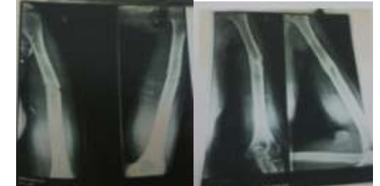
14<sup>TH</sup> WEEK FOLLOW UP XRAY 22<sup>ND</sup> WEEK FOLLOW UP XRAY