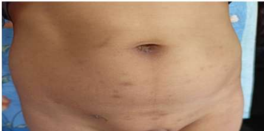
FIG 2 Cosmetic results at follow-up; scars almost not seen.

effective method for minimally invasive inguinal hernia repair in children. Using laparoscopy allows the surgeon to objectively identify asymptomatic or occult contralateral defects, use smaller incisions, and eliminate dissection of the cord structures potentially reducing the risk of cord injury.