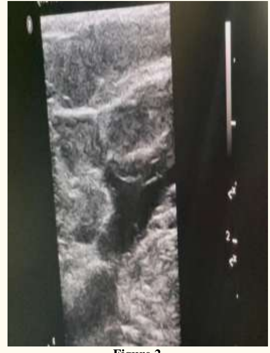
Figure 2 Ultrasopund duplex showing SFJ reflux