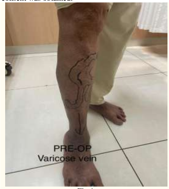
Fig.1 A photo of patient's leg before procedure.

classification was C<sub>3</sub>. He had pigmentation around the left leg (Figure 1,2). A written informed consent was obtained.