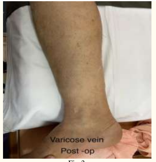
Fig 3 A photo of patient's leg after 48 hr post procedure

With ultrasound guidance, a 5F. delivery catheter in 7F. introducer sheath was advanced to the inguinal area. Delivery catheter tip was positioned 5.0 cm distal to the proximal end of GSV. The proximal end of the saphenous vein was compressed thoroughly by the ultrasound probe with the left hand, at 2 cm proximal to the delivery catheter tip. Two injections of approximately 0.10mL cyanoacrylate glue were each given 1 cm apart at this location, followed by a 3-minute period of local compression with the right hand. Then, repeated single injections and 30 seconds of compression for every 3 cm distally. Additional glue injection was allowed by the author's discretion for areas with large diameter, areas with communicating vein, or with a perforating vein.