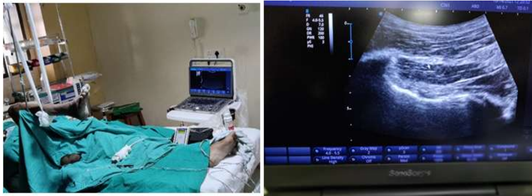
Figure: USG and PNS guided SNB

Pulse rate, systolic blood pressure, diastolic blood pressure, oxygen saturation, sensory and motor blockade and analgesia was monitored every 5 min up to 30 min, then every 15 min up to 2 hrs, there after hourly up to 6 hrs then at 9 th , 12 th & 24 th hour after giving both blocks.