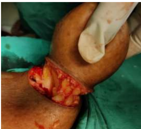
Figure 3: Intraoperative evidence of lipoma