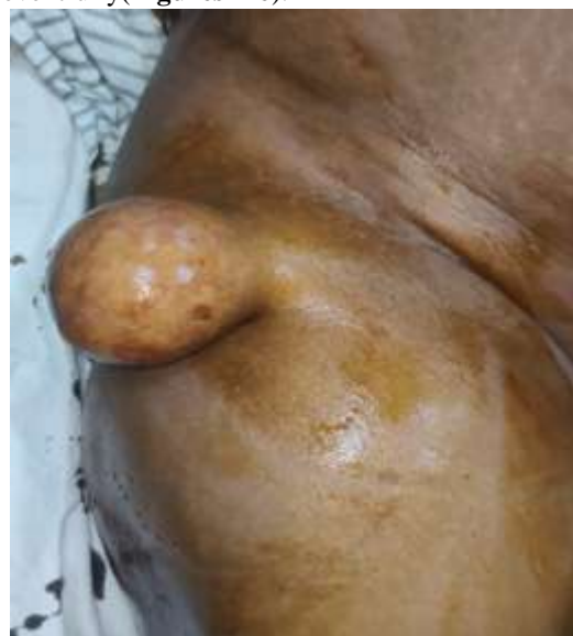
Figure 1: Pedunculated lipoma over anterolateral aspect of right thigh

were no associated complaints of weakness, numbness, difficulty in limb movements, loss of sensations or overlying skin colour changes. There was no history of any other swellings over the body. Patient was not having any associated comorbidities. On clinical examination, a pedunculated swelling of size 7x 5cm over right anterolateral aspect of upper thigh was present. No tenderness or local rise in temperature was present. Swelling was mobile in nature and was not fixed to overlying skin or underlying muscle or bone. Ultrasonography of local swelling was suggestive of lipoma. Patient underwent an elective open excisional surgery for the swelling under local anaesthesia. Patient tolerated the procedure well. Histopathology reports were confirmatory for lipoma. Patient was discharged uneventfully (Figures 1-6).