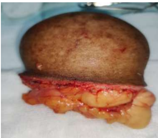
Figure 4: Excised specimen