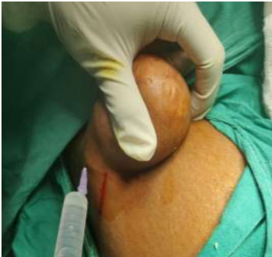
Figure 2: Infiltration of local anaesthesia for operative procedure