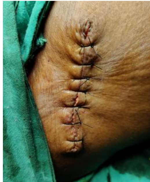
Figure 5: Skin closure after excision of lipoma