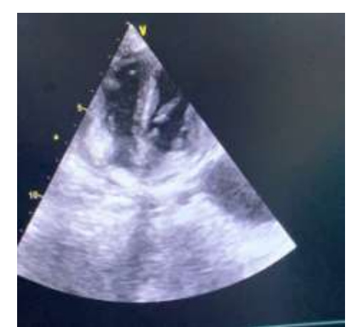
Figure 2. 2DECHO subcostal view with complete drainage of pericardial fluid with good biventricular function

The fluid suggestive of transudate so albumin transfusion given. During this, femoral central line was inserted following which she developed right leg Deep Vein Thrombosis diagnosed by ultrasonography doppler study, aspirin was added. Later she developed right leg cellulitis for which ampicillin plus cloxacillin started and it got resolved. After draining of cardiac tamponade there was significant improvement in cardiac output and oedema reduced and there was significant weight loss, she was discharged on oral prednisolone, diuretics, antihypertensives, Antithrombotic and supportive therapy on biweekly follow up. Her next cycle of Rituximab has been planned.