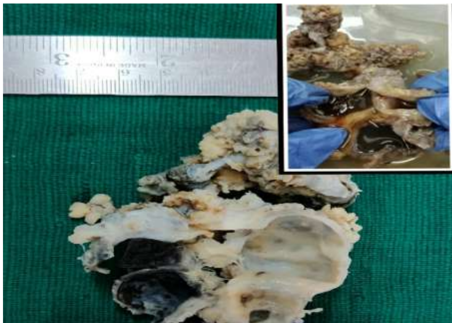
Figure- 2: Excised globular cystic neck mass showing papillary projections and brownish fluid filled cavity.

consistency and greyish in colour. On cut section brownish coloured fluid came out. Appropriate sections from representative areas were taken for microscopic examination.