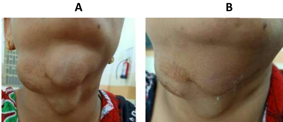
Figure- 1: Image A is showing multiple cystic neck swellings. Image B shows reduction in size of the swellings after fineneedle aspiration.