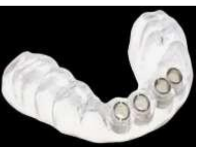
Fig.7: Complete drill guide