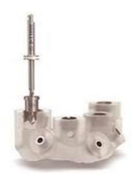
Fig.8: Safe guide/easy guide