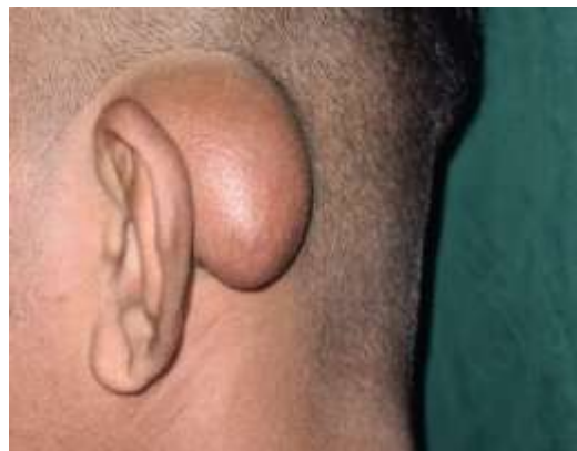
Fig 1: left epidermoid cyst in a 9 year old male.

history trauma, fever, loss of appetite, discharging ear, difficulty in hearing, etc. The patient had no other complaints or other constitutional symptoms. There was no history of such lesions in his family members. A preliminary diagnosis of epidermoid cyst, dermoid cyst, or sebaceous cyst was proposed. Fine Needle Aspiration Cytology (FNAC) was done and revealed the presence of yellowish thick material, which was sent for cytological examination. The treatment consisted of total surgical removal of the lesion.