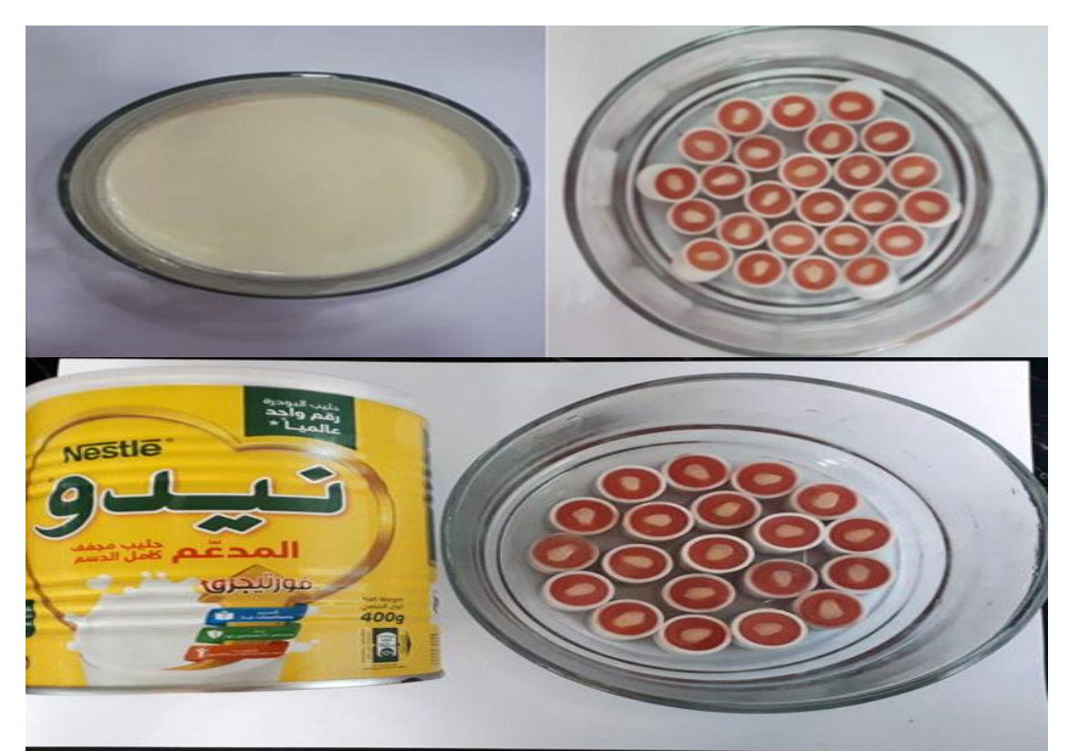
Figure (1) The Remineralization Treatment Groups. A-Commercial CPP-ACP Group B- Fresh Buffalo Milk Group. C- Nido Powder Milk Group