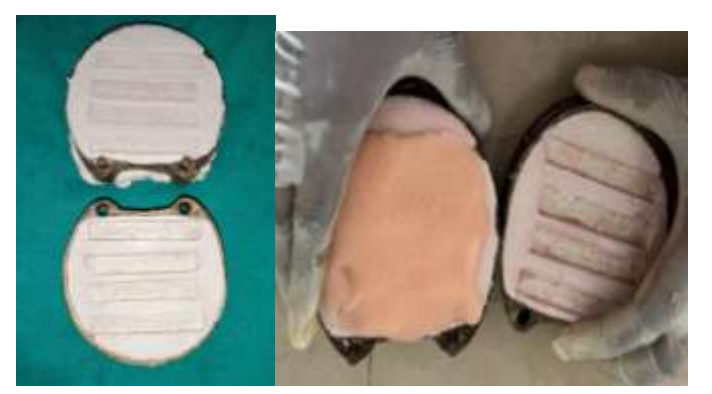
figure 1:&2 Flasking, dewaxing, and acrylisation done

To standardize and simulate denture roughness at the palatal site, all specimens were prepared first with 800-grid, followed by 1200-grid, sandpaper (Struers SiC Foil #800 and #1200, Struers RotoPol-22, Struers GmbH, Copenhagen, Denmark).<sup>(1)</sup>