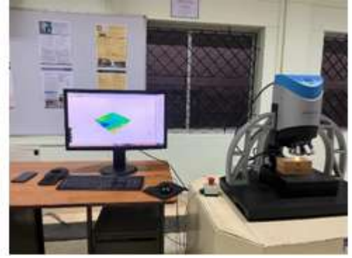
Figure 3 :surface profilometr