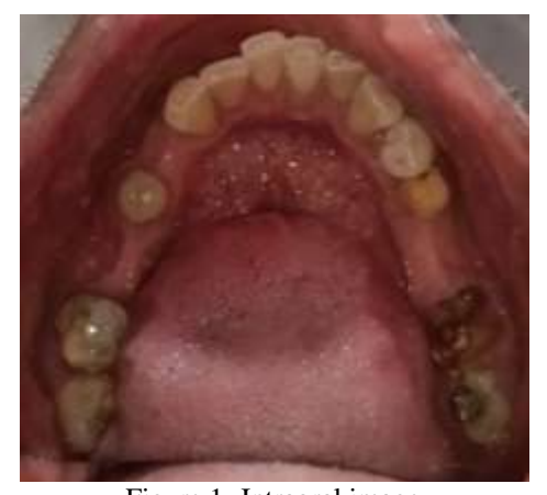
Figure 1- Intraoral image

As a result, precise design philosophy, planning is essential for the reflexive fit of non-rigid connectors, which significantly decreased the leverage effect and contributed to the long-term performance of the long-span FPD with pier abutments.