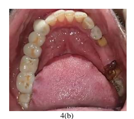
Figure 4(a)-porcelain fused to metal bridge, after ceramic firing, 4(b)- Post cementation of the prosthesis