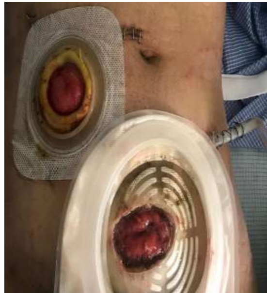
Figure_1D : Ileostomy with distal mucus fistula