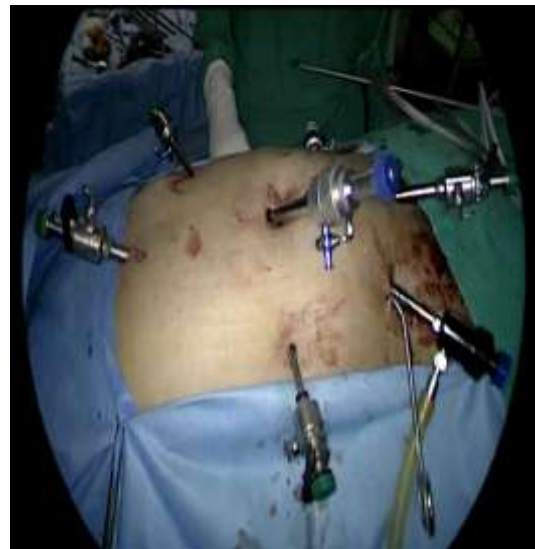
Figure_1A: Position of seven ports

During follow up stool frequency was 6-8 episodes with no evidence of pouch complications.