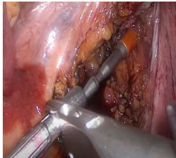
Figure_1E : Ileal J pouch construction