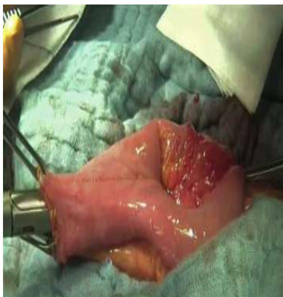
Figure_1F : Ileal Pouch Anal Anastomosis (IPAA) with circular stapler