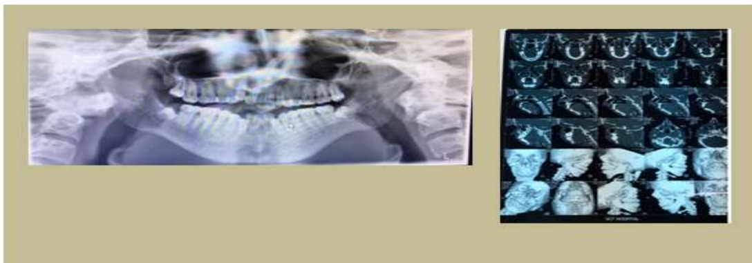
Figure 6 OPG

demonstrate that TCS patients have decreased sella-nasion-B point (SNB) angles and generally normal sella-nasion-A point (SNA). These features are further accentuated because of decreased posterior facial height and clockwise rotation of the occlusal plane. The most severe forms of TCS may have significantly deficient proximal mandible or even lacking the ramus/condyle unit altogether. A temporal-bone CT using thin slices makes it possible to diagnose the degree of stenosis and atresia of the external auditory canal, the status of the middle ear cavity, the absent or dysplastic and rudimentary ossicles, or inner ear abnormalities such as a deficient cochlea. Two- and three-dimensional CT reconstructions with VRT and bone and skin-surfacing are helpful for more accurate staging and the three-dimensional planning of mandibular and external ear reconstructive surgery[Figure:7].