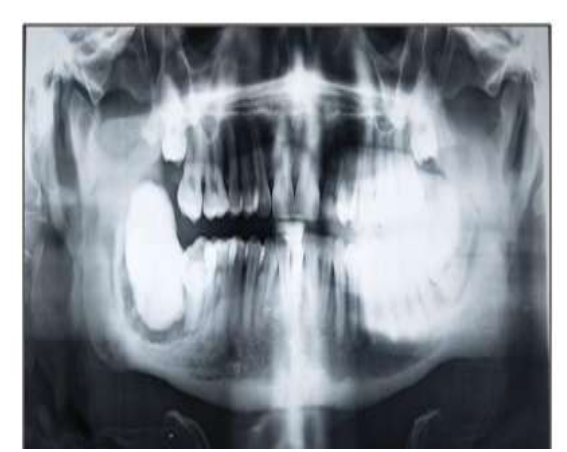
Fig. 2 Preoperative OPG showing homogenous radiopacity with surrounding radiolucent band at the base distal margin. Shadow of impacted third molar is also visible.

On panoramic radiograph, large homogeneous radiopacity was seen along with an impacted third molar. Periphery of the lesion was well defined with irregular surface surrounded by the thick radiolucent shadow in the inferior aspect of lesion. The lesion extended from the distal part of right mandibular second molar(48) to alveolar border of ramus superiorly (Fig. 2).