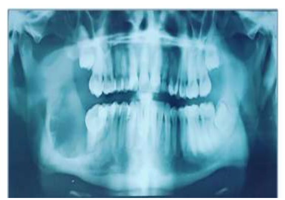
Fig. 6 Postoperative OPG showing complete enucleation of the lesion.