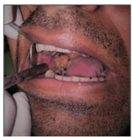
Fig. 1 Intraoral swelling and breach in the buccal

On panoramic radiograph, large homogeneous radiopacity was seen along with an impacted third molar. Periphery of the lesion was well defined with irregular surface surrounded by the thick radiolucent shadow in the inferior aspect of lesion. The lesion extended from the distal part of right mandibular second molar(48) to alveolar border of ramus superiorly (Fig. 2).