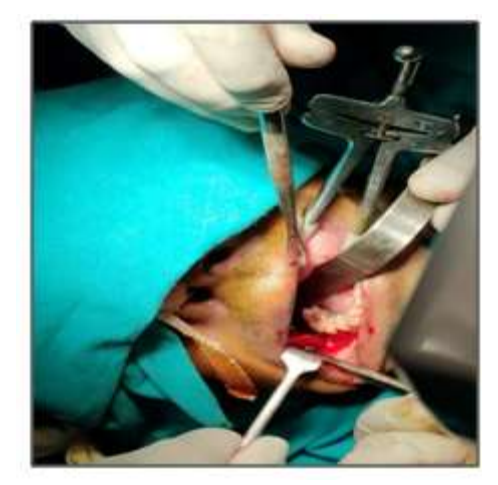
Fig. 4 Photograph showing intraoral approach

specimen was send to the histopathological examination which revealed decalcfiedirreularly organized structures of enamel, dentin and pulp and islands of odontogenic tissue in fibrous capsule.