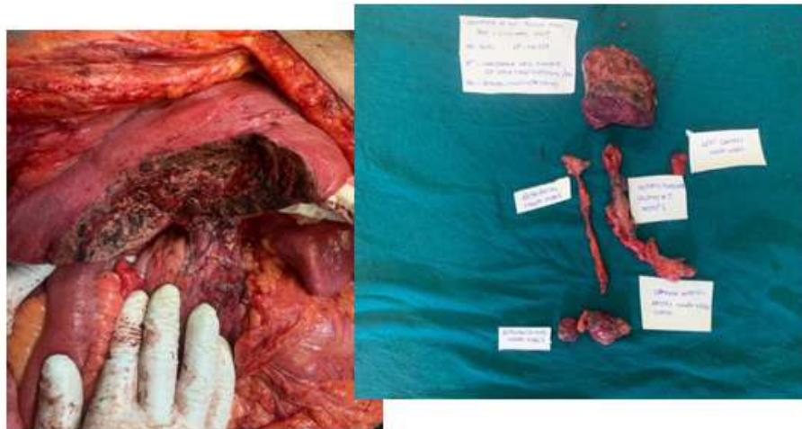
Figure 4a: intraoperative picture after completion radical cholecystectomy, 4b specimen showing resection liver and lymph nodes.