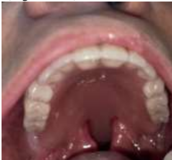
FIGURE 7: - Intraoral view with dentures

Subsequently, complete dentures were provided to the patient (Figure 5&6).