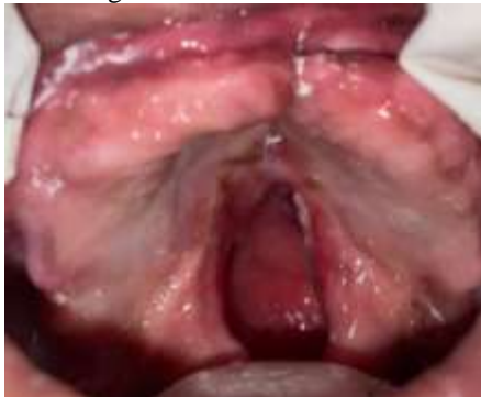
FIGURE 1: - Cleft palate

To address these issues, the treatment plan involved crafting a complete denture pharyngeal obturator prosthesis along with a mandibular complete denture. The palatal component of the prosthesis aimed to cover the hard palate defect, preventing food and liquid accumulation and thereby enhancing speech and swallowing. Additionally, the pharyngeal portion extended posteriorly to the palatal plane and above the soft palate, establishing contact with the posterior and lateral pharyngeal walls during normal function. This design facilitated the restoration of velopharyngeal sphincter closure, contributing to improved speech and swallowing function.