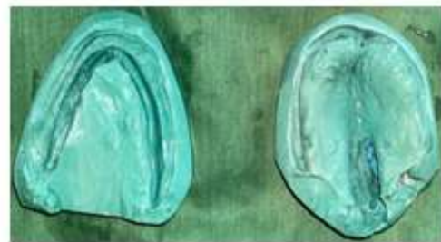
FIGURE 3: - Master Cast

forward, touch their chest, and then move it backwards. A softened modelling plastic impression compound was added to record the lateral aspects, and the patient was instructed to perform side-to-side movements. Additionally, the patient was asked to repeatedly and forcefully phonate the sound "ah." The impression surface was adjusted until the patient was satisfied with speech and comfort. Secondary impressions were then taken using light-body elastomeric impression material (3M ESPE Light body impression material).