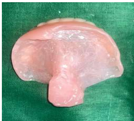
FIGURE 6: - Intaglio surface of dentures

Subsequently, complete dentures were provided to the patient (Figure 5&6).