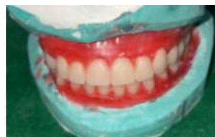
FIGURE 4: -Teeth arrangement

Jaw relations were recorded, and this was followed by a try-in session (Figure 4). During the try-in, assessments were made for speech, aesthetics, and swallowing. Speech evaluation was conducted using tests such as perceptual analyses, resonance frequency analyses, and acoustic analyses, revealing a significant improvement in speech. To assess swallowing, the patient was requested to drink water to check for any regurgitation. It was observed that the denture effectively prevented the regurgitation of liquid during swallowing.