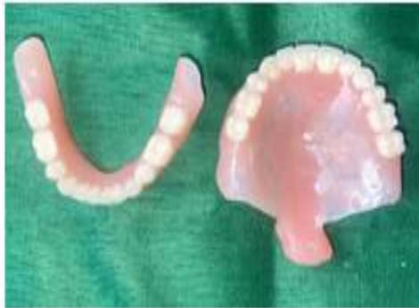
FIGURE 5: - Patient's dentures