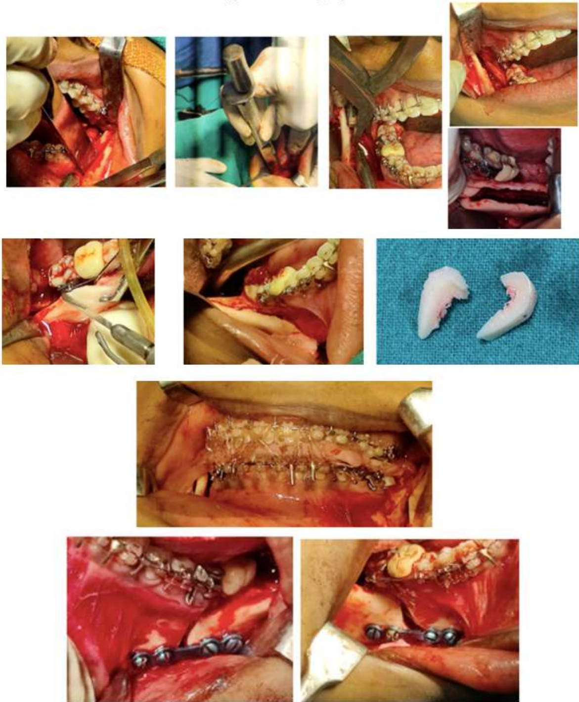
FIG.2 Intra Operative Photographs of Patient 01