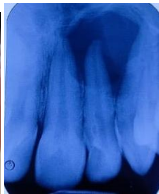
Fig d: IOPAR irt 22