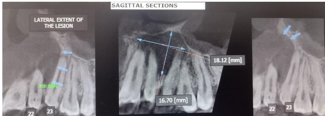
Fig f: CBCT Image: Sagittal View