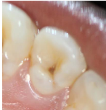
Fig c: Deep Palatal Pit irt 22