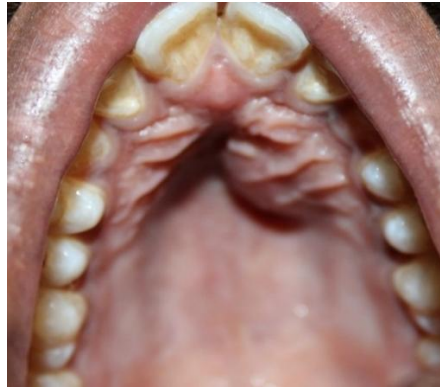
Fig b: Intra Oral Palatal Swelling