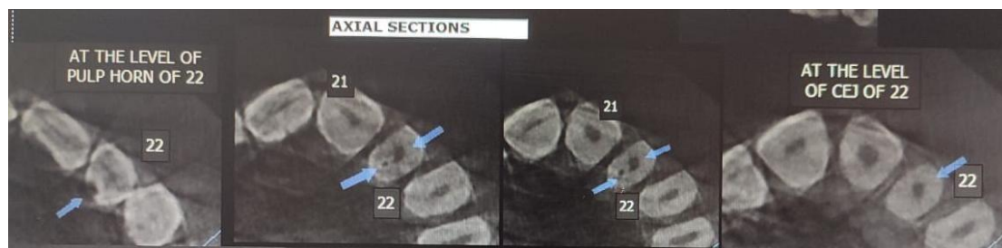
Fig g: CBCT Image: Axial View