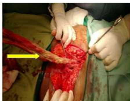
Fig 5 Surgical mop which was removed

noted that six inches of small bowel had areas of ischemia and necrosis with a purulent coating. Therefore, resection and anastomosis were performed. Postoperative course was uneventful.