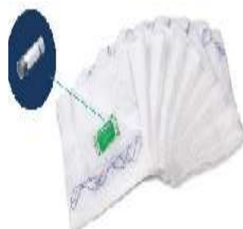
Fig 6: RF detect sponge