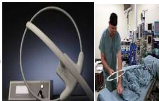
Fig 7 and Fig 8; Magic wand