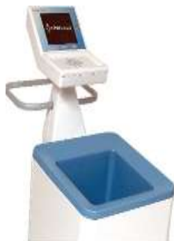
Fig 5: RFID surgical sponge tracking