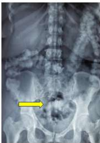
Fig 1 Abdominal X ray showing radiopaque serpiginous thread in the pelvic region

Routine laboratory tests were normal including the inflammatory markers. Abdominal X-ray was performed which was suggestive of retained surgical swab. A CT scan was also performed which confirmed the diagnosis.