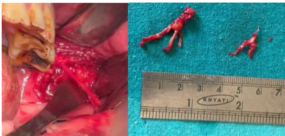
Fig. 2. Skeletonization of the mental nerve (upper left). Obliteration of the mental foramen with bone wax (upper right). Long buccal nerve exposed (lower left). Avulsed nerves (lower right)

Cases 3 and 4 involved trigeminal neuralgia in a 56-year-old female (Case 3) affecting the mental nerve, and a 51-year-old female (Case 4) affecting the inferior alveolar nerve. Case 3 (Fig. 3) was treated similarly to Case 1, while Case 4 (Fig. 4) underwent an inferior alveolar nerve