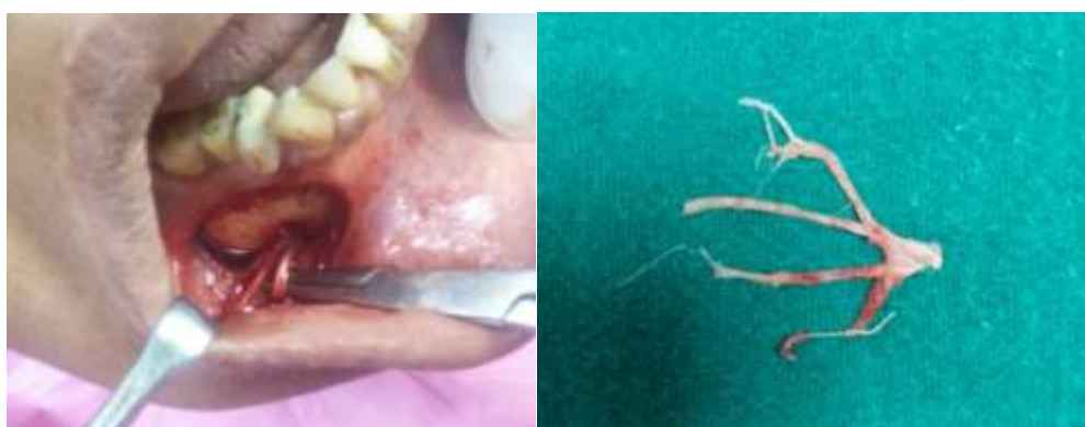
Fig.3. Skeletonization of the mental nerve (left). Avulsed mental nerve (right)