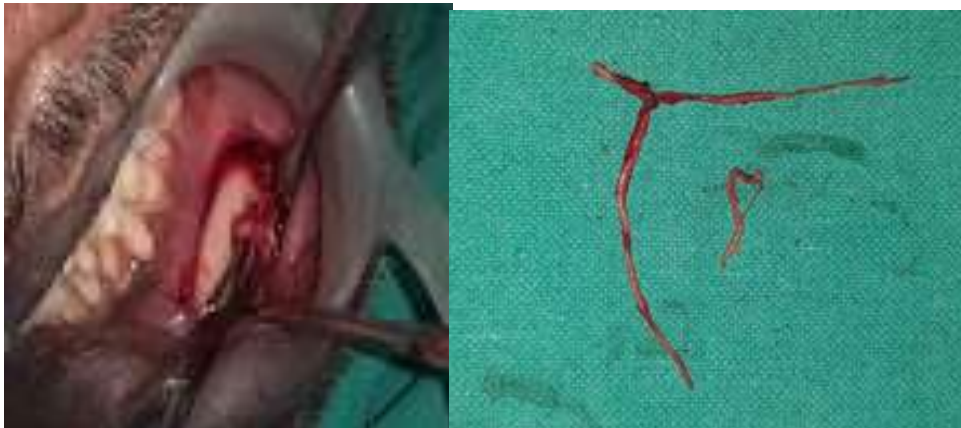
Fig. 1. Skeletonization of the mental nerve (left). Avulsed mental nerve (right)

achieved, and the incision was closed with 3-0 silk sutures. Postoperatively, the patient had an uneventful recovery, remained symptom-free for one year, and was not on any medication. (Fig. 1)