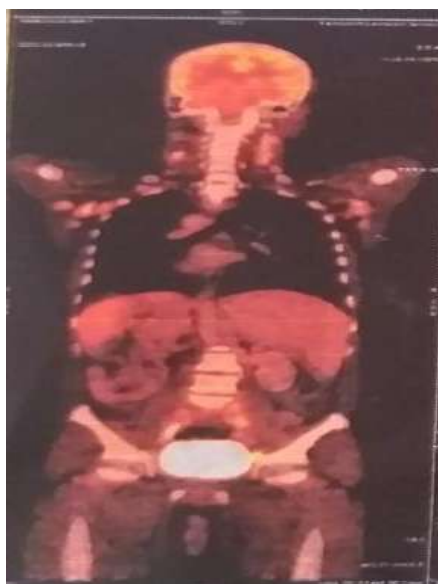
Pic 7: Colour PET-CT scan highlighting systemic inflammation with increased uptake in peripheral lymph nodes and the axial skeleton, supporting the diagnosis of a hyperinflammatory condition