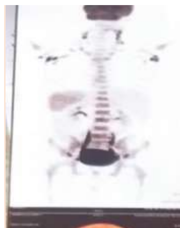
Pic 6: Grayscale PET-CT scan showing hypermetabolic activity along the sacroiliac joints and vertebral column, indicative of active inflammation in ankylosing spondylitis.

Radiological evaluation was pivotal in diagnosing the systemic inflammation associated with the patient's condition. Positron Emission Tomography-Computed Tomography (PET-CT) was performed to assess inflammatory activity and rule out malignancies or infections. The grayscale PET-CT scan ( Figure 6 ) revealed hypermetabolic activity along the axial skeleton, particularly in the sacroiliac joints and vertebral column, consistent with active inflammation characteristic of ankylosing spondylitis. The colored PET-CT scan ( Figure 7 ) demonstrated widespread metabolic activity, including significant tracer uptake in peripheral lymph nodes and the axial skeleton, indicating systemic inflammation. These findings corroborated the presence of hyperinflammatory states associated with adult-onset Still's disease, in addition to underlying ankylosing spondylitis.