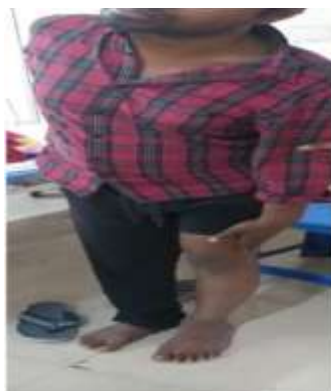
Pic.2: Kyphotic posture with structural deformity and pelvic imbalance due to ankylosing spondylitis.