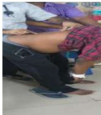
Pic.3: Forward bending test showing restricted lumbar spine flexibility, suggesting spinal ankylosis.