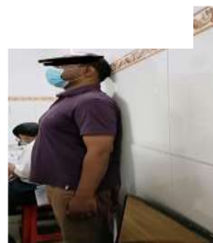
Pic.4: Loss of lumbar lordosis and thoracic spine mobility evident in standing posture against the wall.