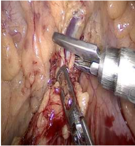
Figure_1B: Ligation of Sigmoid artery