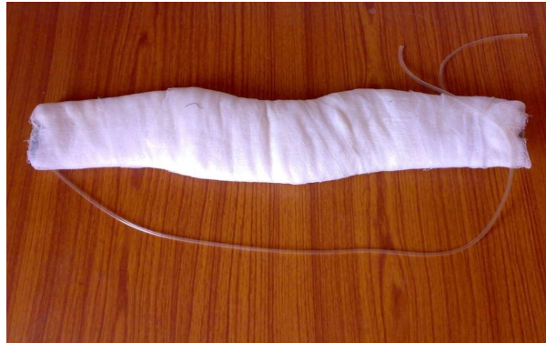
Fig. 3: Zero Cost Soft Cervical Collar - Prepared and ready for Use.